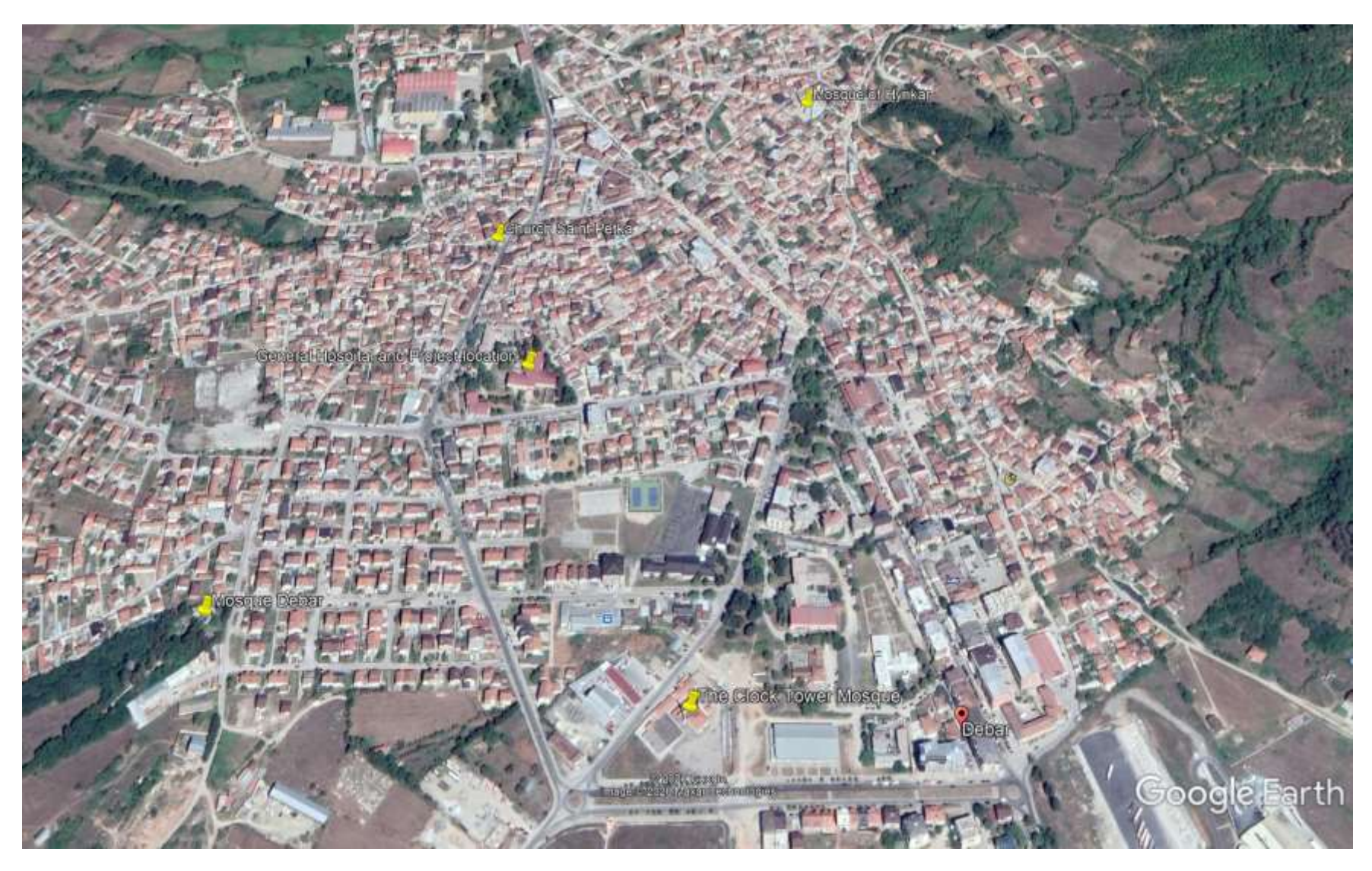
Figure 1 Micro location of the project area in Municipality of Debar