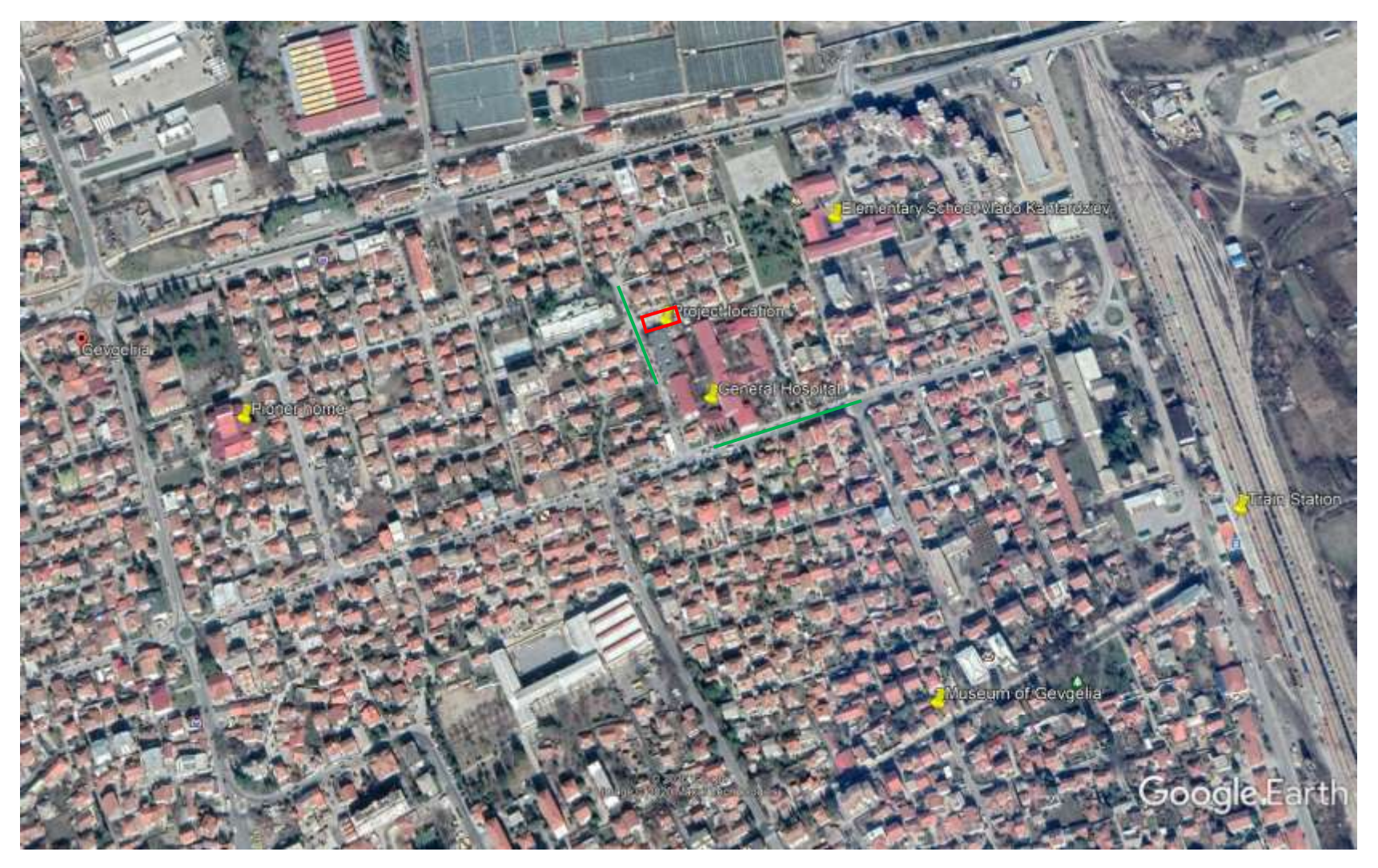
Figure 1 Micro location of the project area in Municipality of Gevgelija