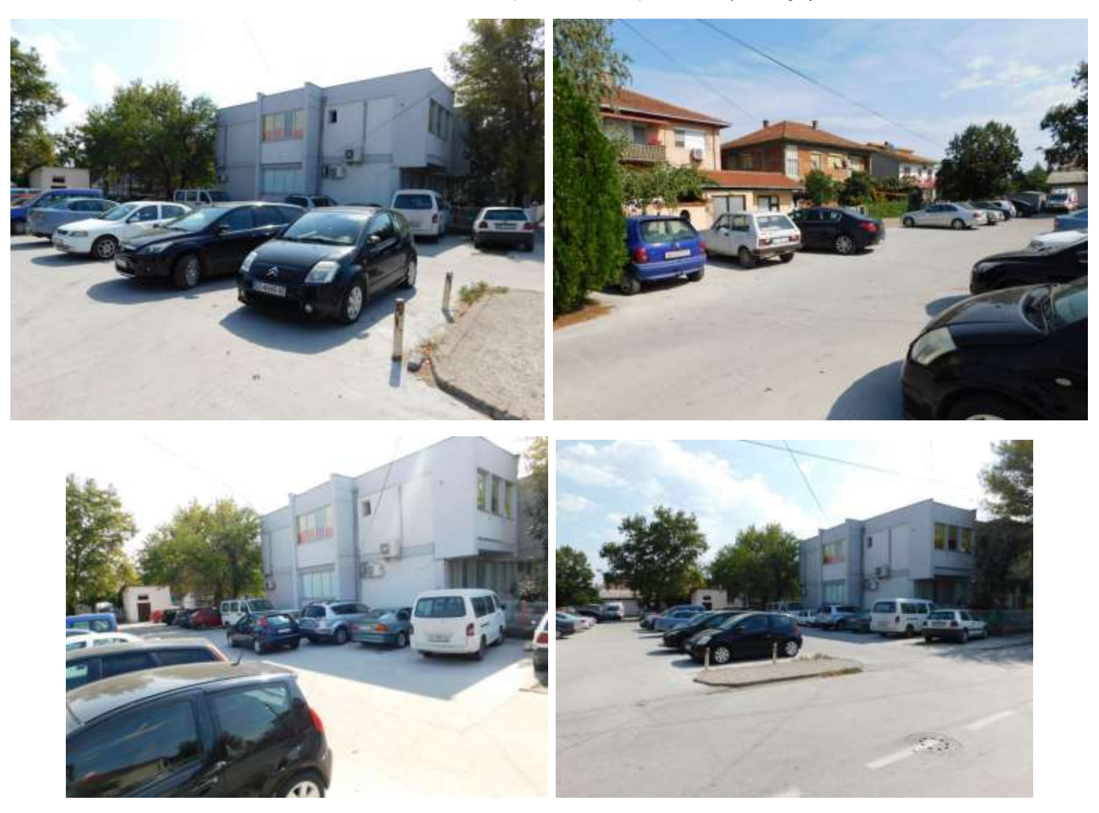
Figure 2 Pictures of the location were the mobile COVID 19 hospital will be installed