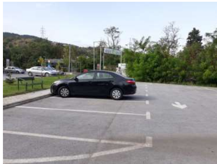
Figure 2 Pictures of the location where the mobile COVID 19 hospital will be installed