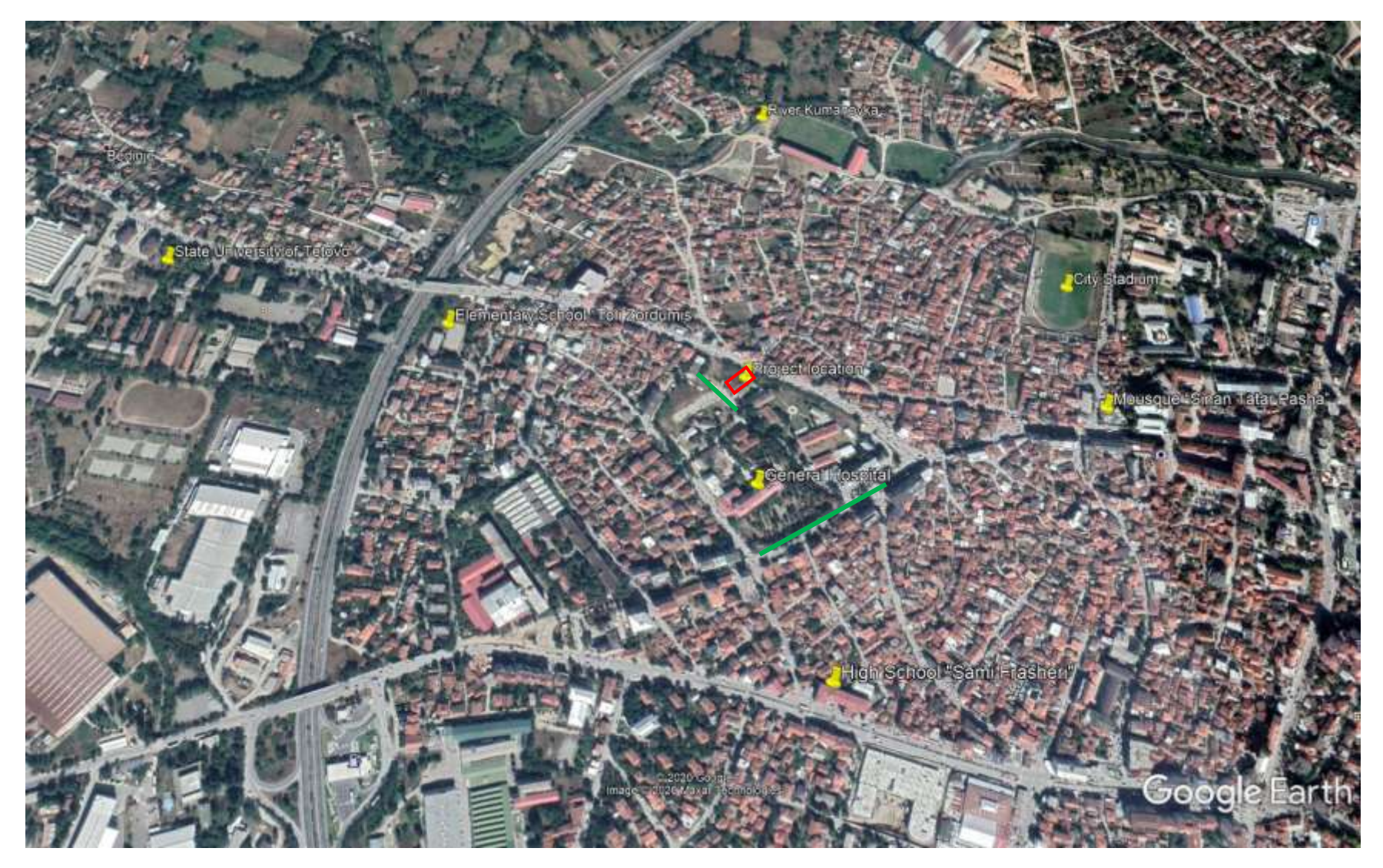
Figure 1 Micro location of the project area in Municipality of Kumanovo