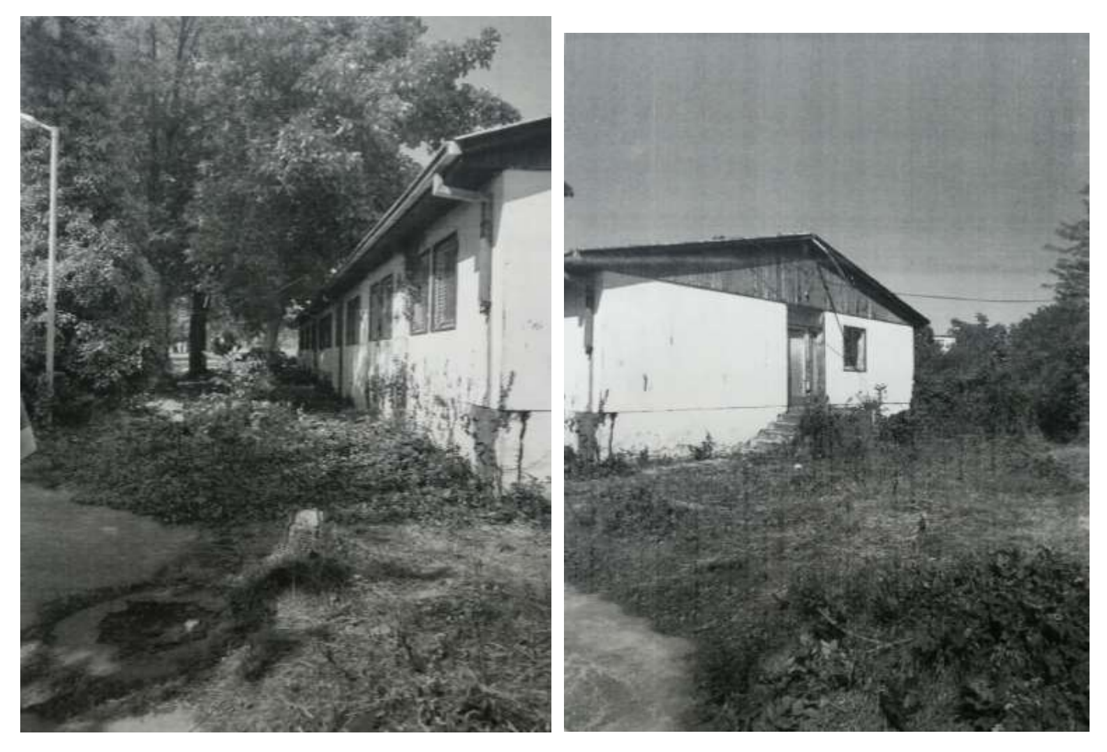
Figure 2 Pictures of the location were the mobile COVID 19 hospital will be installed