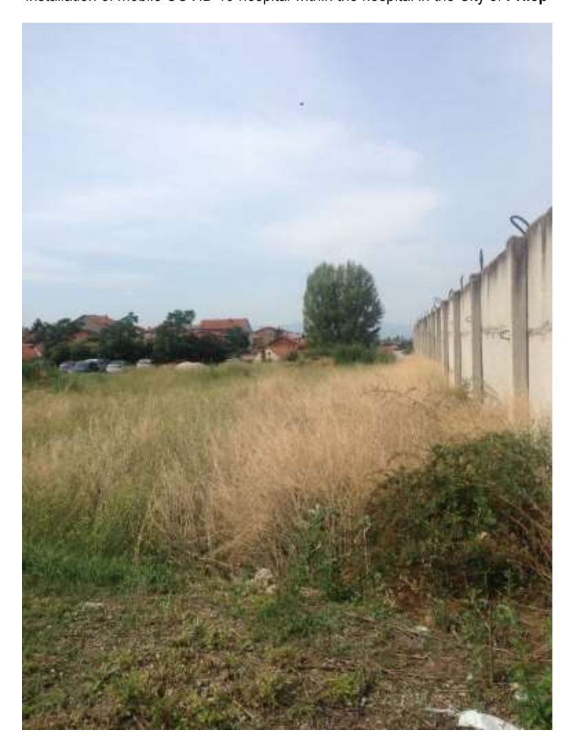
Figure 2 Pictures of the location were the mobile COVID 19 hospital will be installed