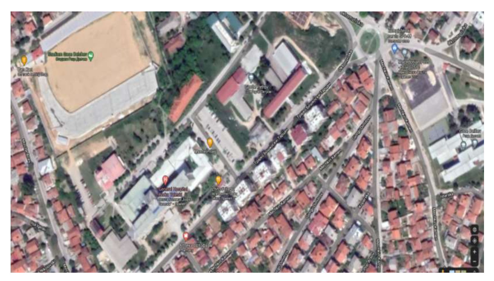
Figure 1 Micro location of the project area in Municipality of Prilep