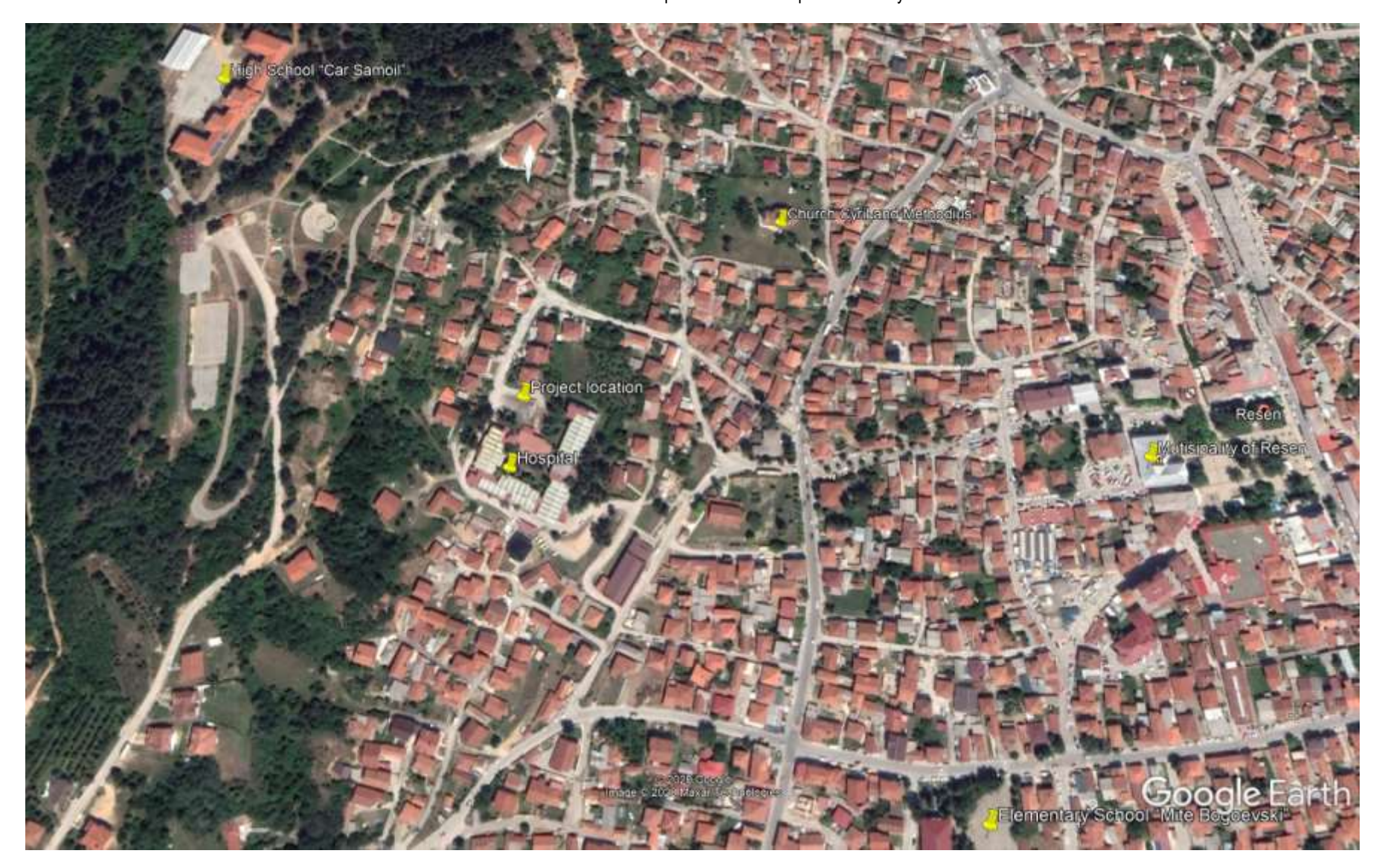
Figure 1 Micro location of the project area in Municipality of Resen