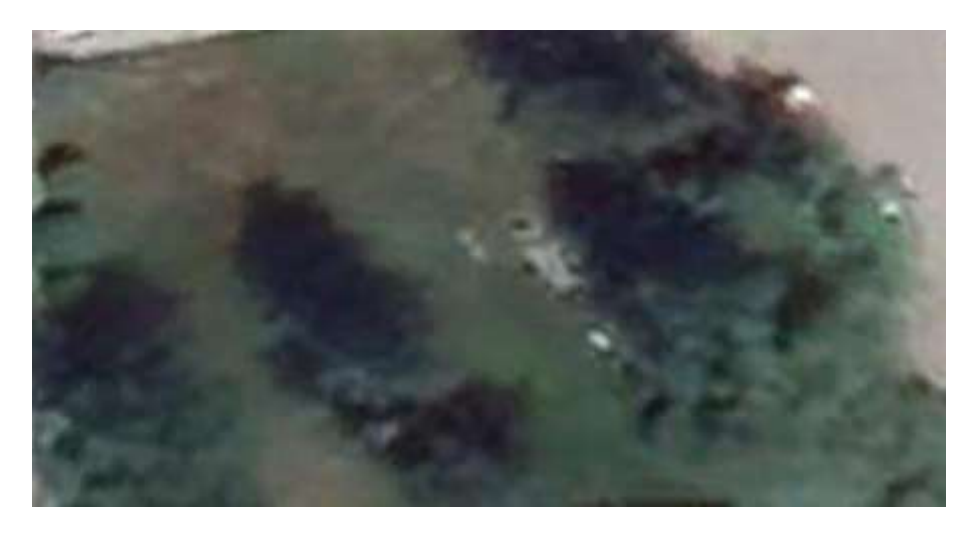
Figure 2 Pictures of the location were the mobile COVID 19 hospital will be installed