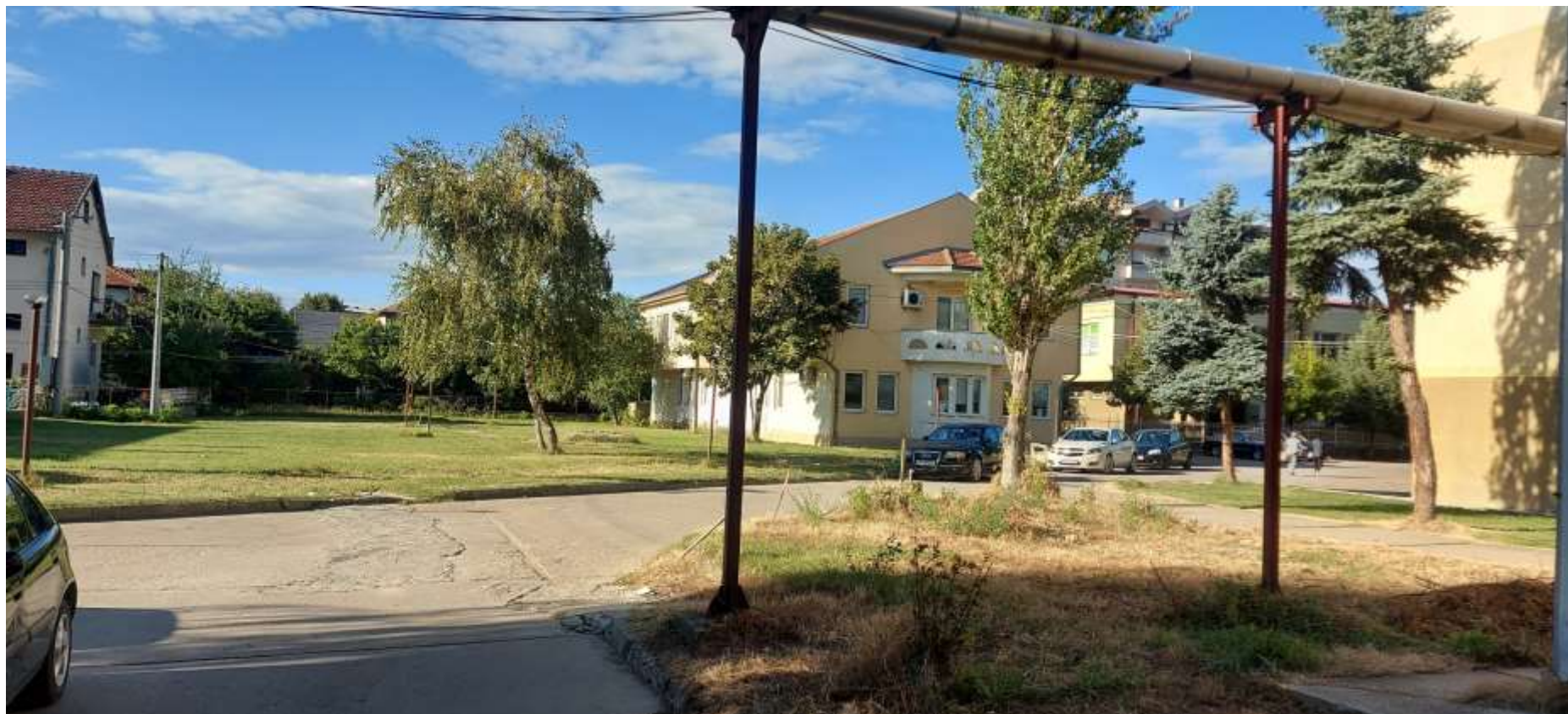
Figure 2 Pictures of the location where the mobile COVID 19 hospital will be installed