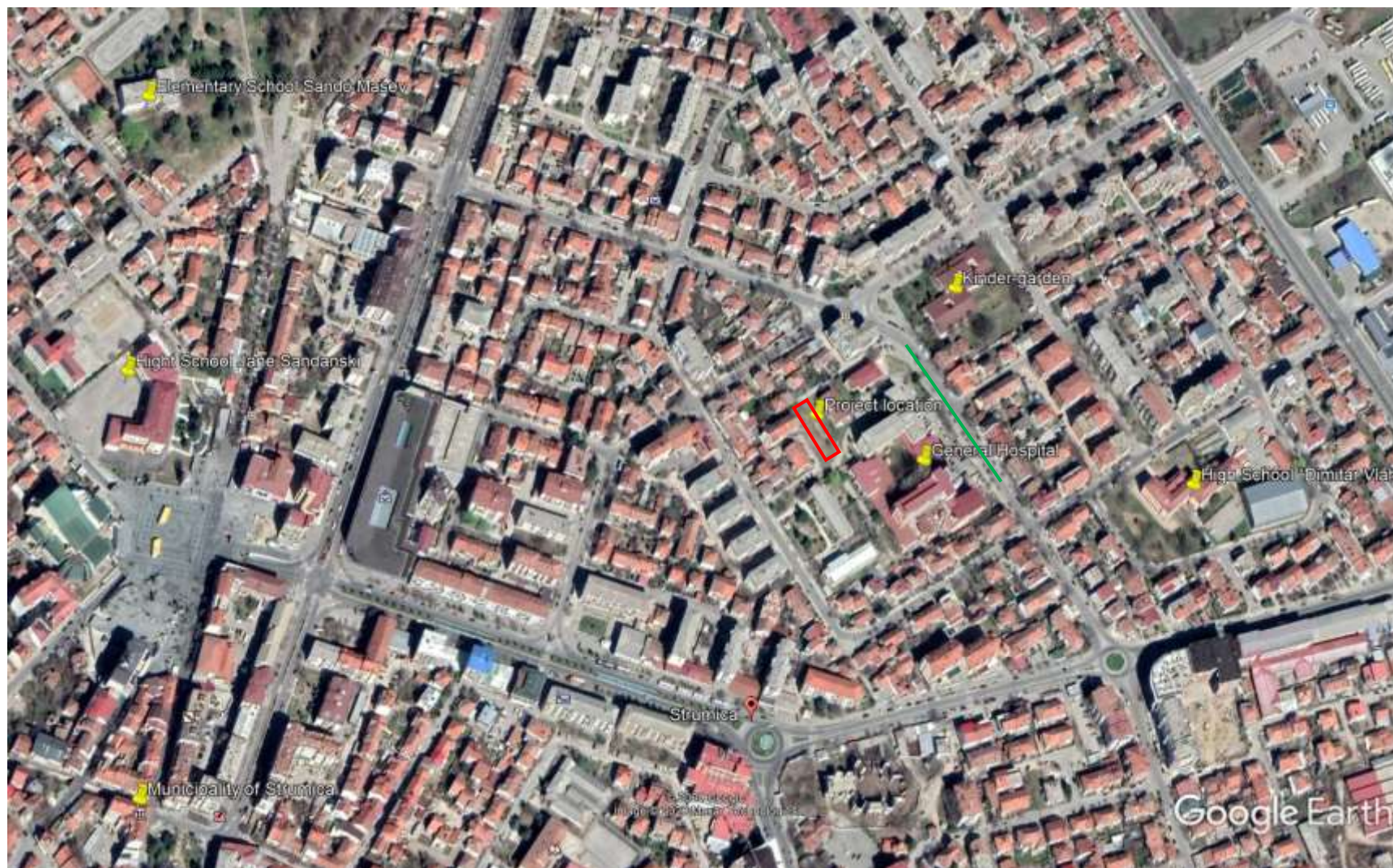
Figure 1 Micro location of the project area in Municipality of Strumica