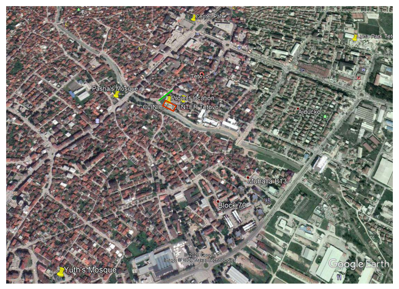
Figure 1 Micro location of the project area in Municipality of Tetovo

"Installation of mobile COVID 19 hospital within the hospital in the City of Tetovo"