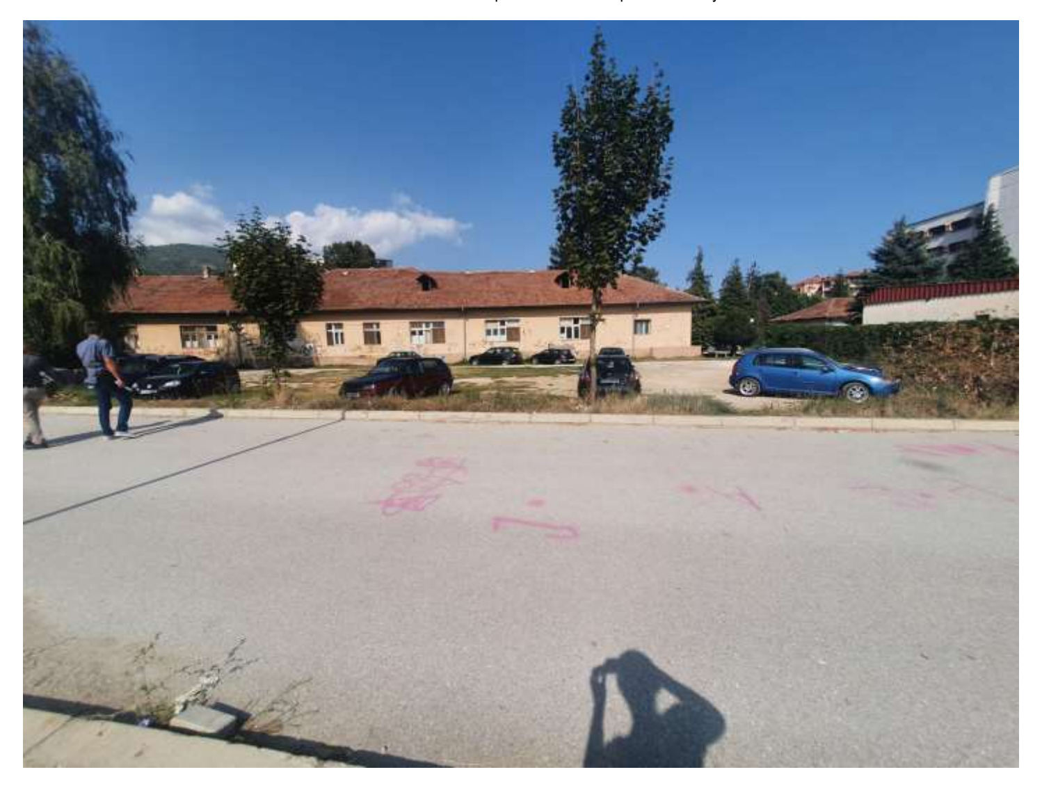
Figure 2 Pictures of the location were the mobile COVID 19 hospital will be installed