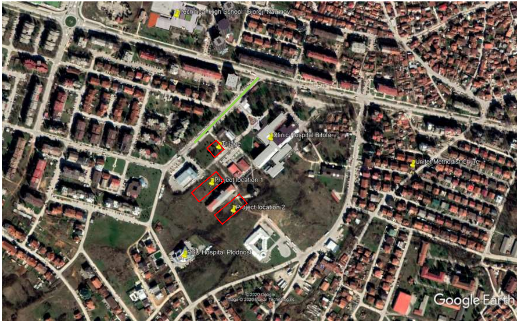
Figure 1 Micro location of the project area in Municipality of Bitola