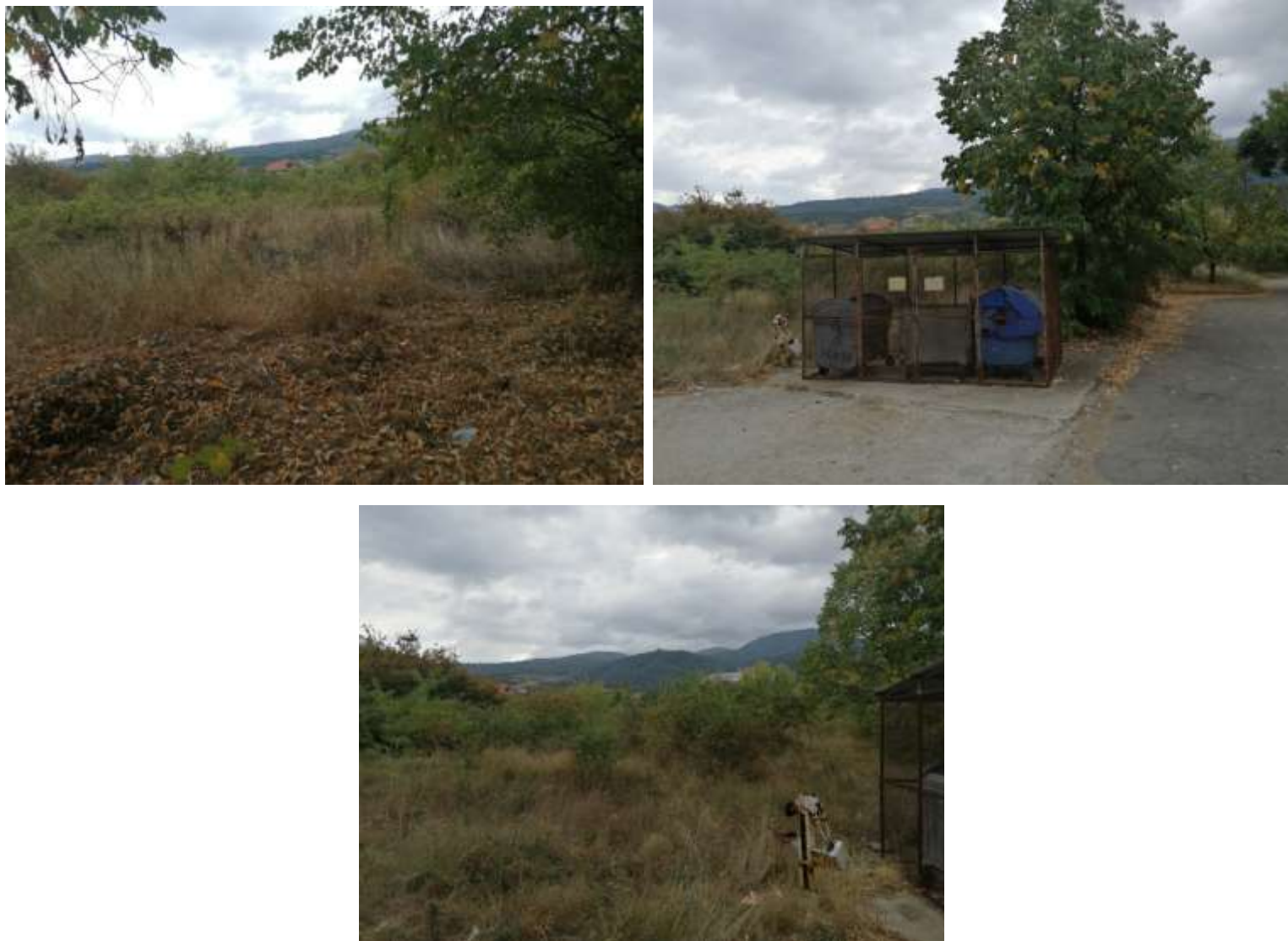
Figure 2 Pictures of the location where the mobile COVID 19 hospital will be installed