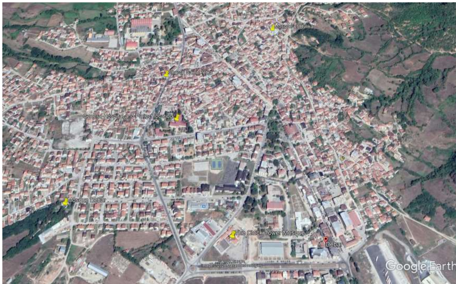
Figure 1 Micro location of the project area in Municipality of Debar