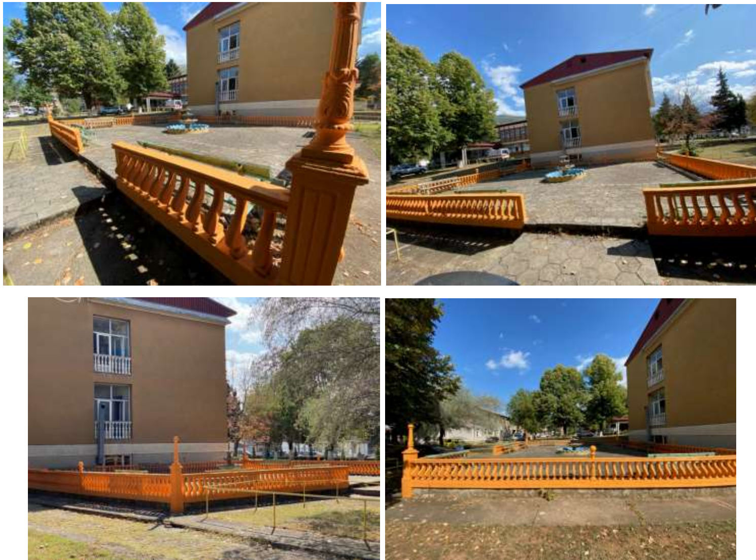
Figure 2 Pictures of the location where the mobile COVID 19 hospital will be installed