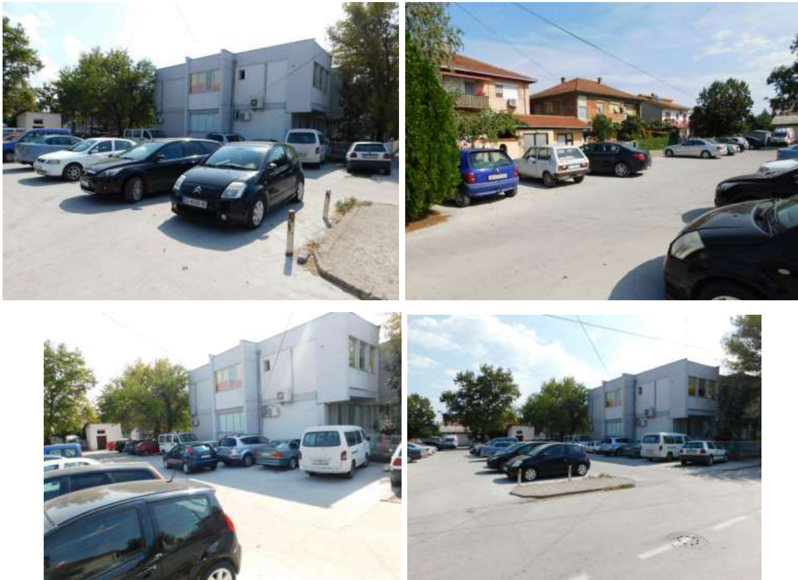
Figure 2 Pictures of the location where the mobile COVID 19 hospital will be installed