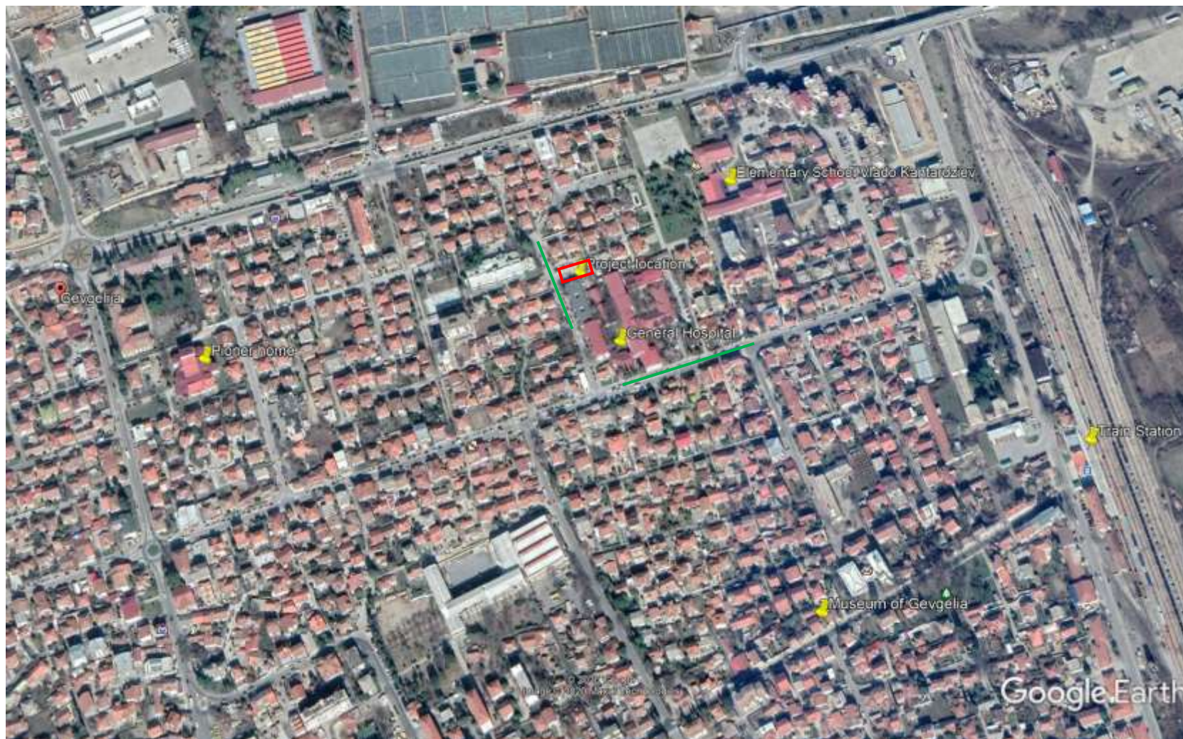
Figure 1 Micro location of the project area in Municipality of Gevgelija