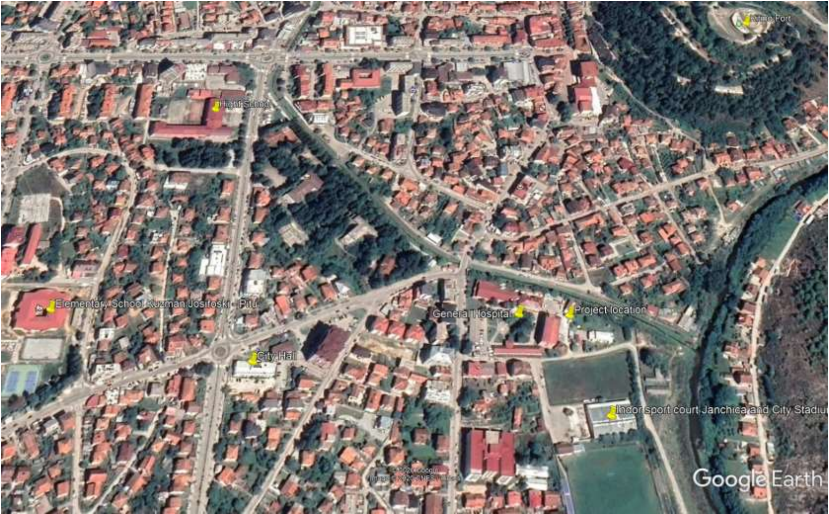
Figure 1 Micro location of the project area in Municipality of Kichevo