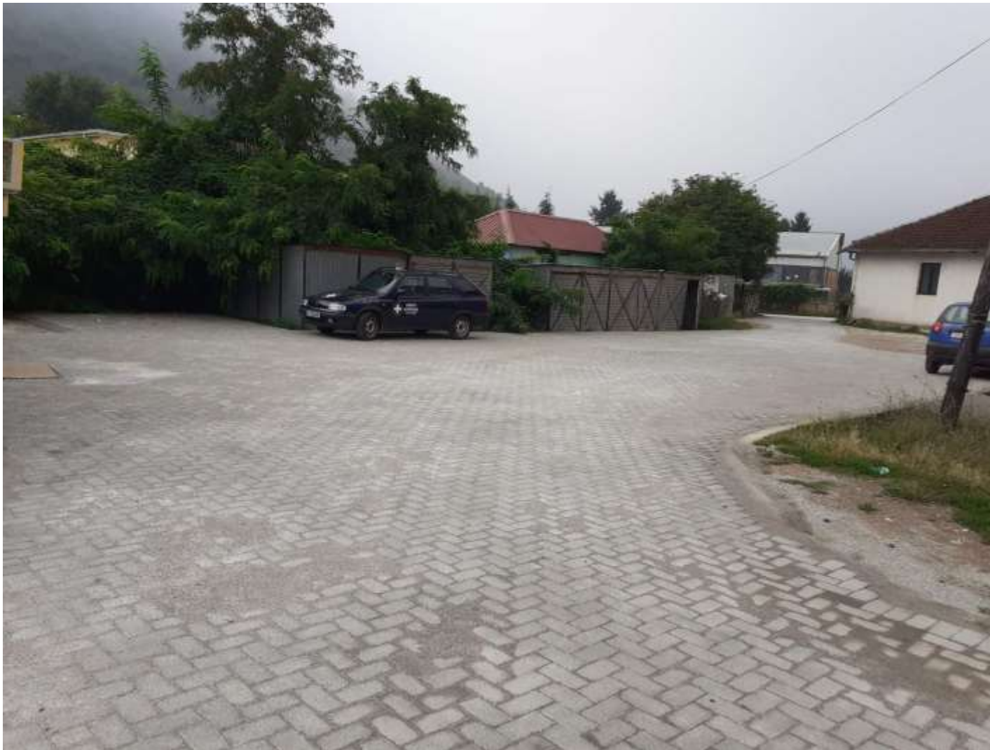
Figure 2 Pictures of the location where the mobile COVID 19 hospital will be installed