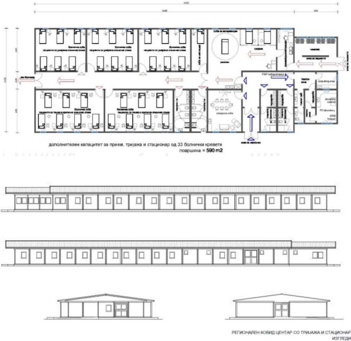
Figure 3 The look of the extended construction of the mobile hospital in Municipality of Kavadarci