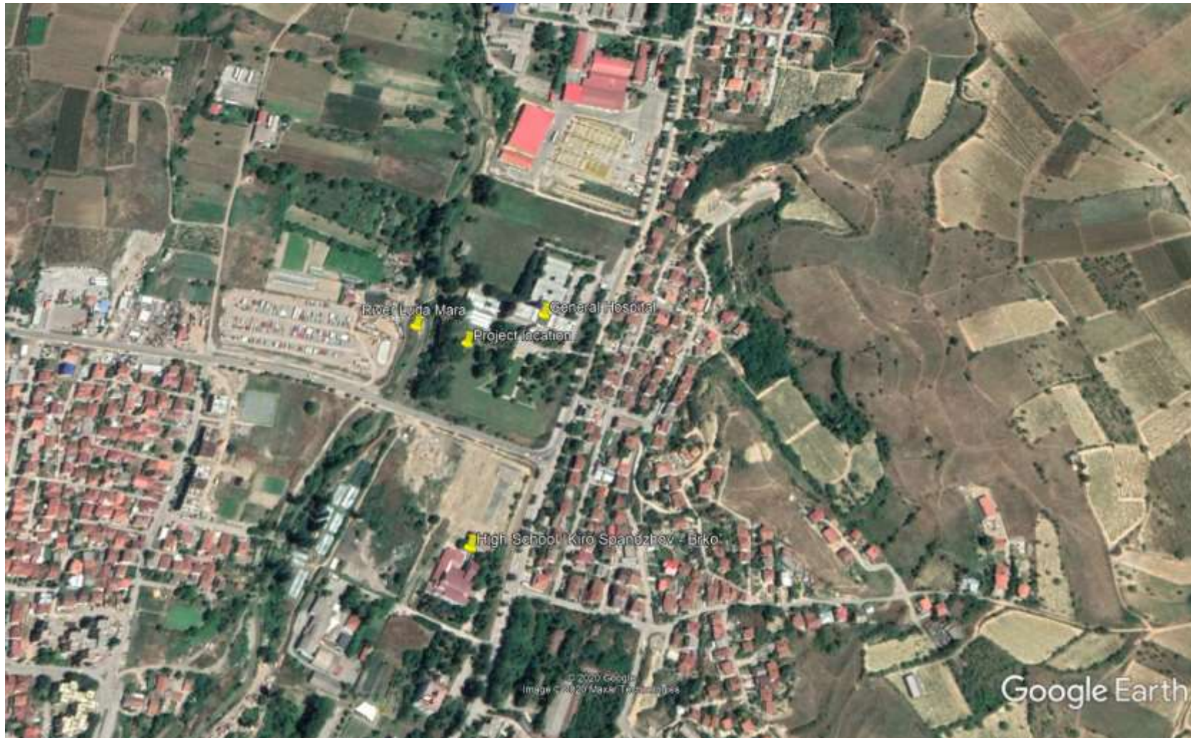
Figure 1 Micro location of the project area in Municipality of Kavadarci