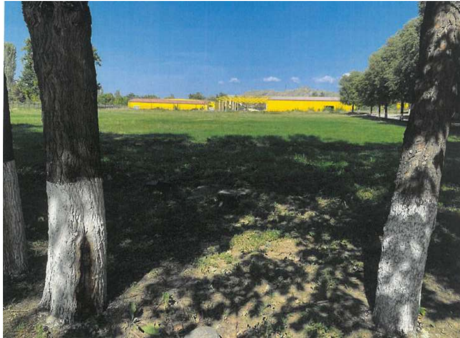
Figure 2 Pictures of the location where the mobile COVID 19 hospital will be installed